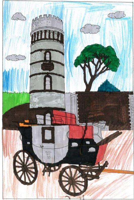
Crampton Tower Museum and The Broadstairs Stage Coach